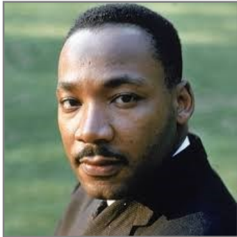
Rev. Dr. Martin Luther King, Jr.

include everyone, to transform unjust social arrangements, and to lift us up to be the generous and noble human beings we were intended to be by our Creator. In terms of a mutual support network, Dr. King's vision allows us to see one another as partners in the mobilization of that deep love, hidden, but yearning to be born, in every human heart. ( Rev. Dr. Martin Luther King, Jr. Study Resources )